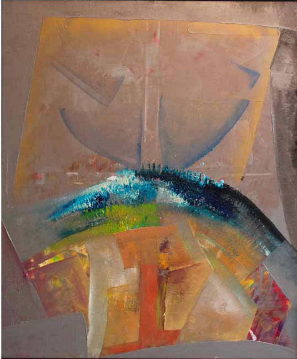
Flow | 2012 | 47,2 x 39,37 in