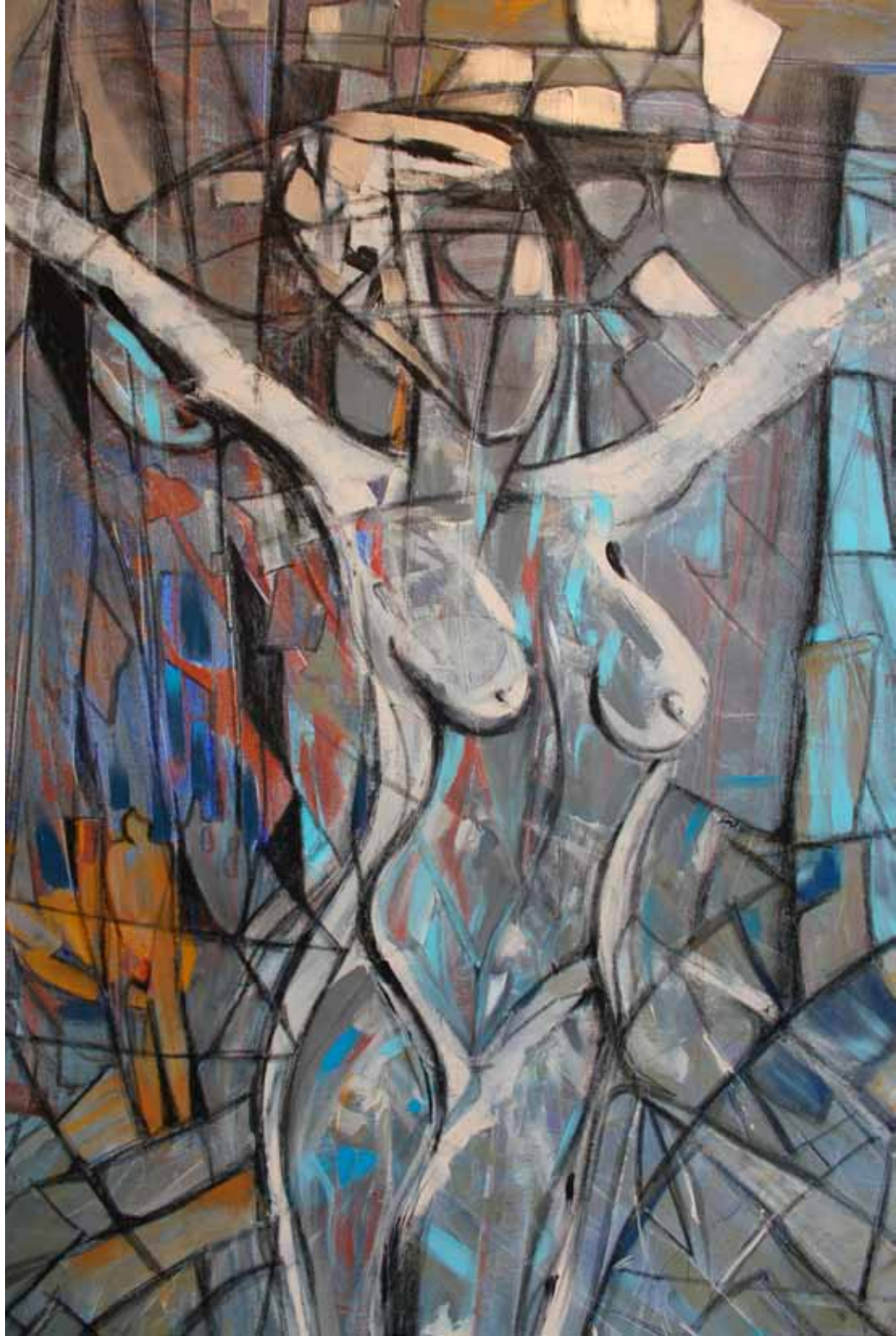
Woman in the glass | 2011 | 39,37 x 59,1 in