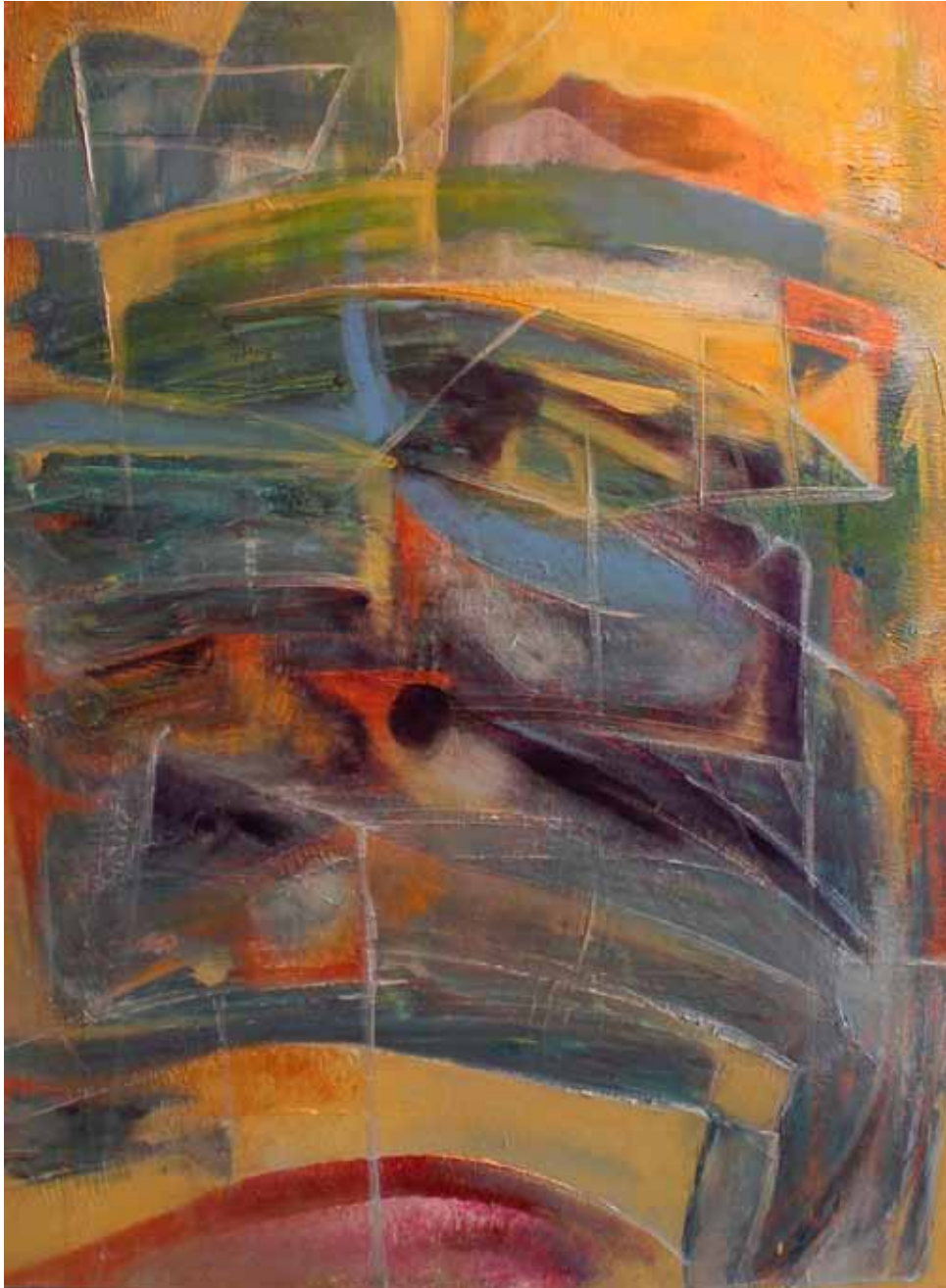
Intervention | 2011 | 23,6 x 31,5 in