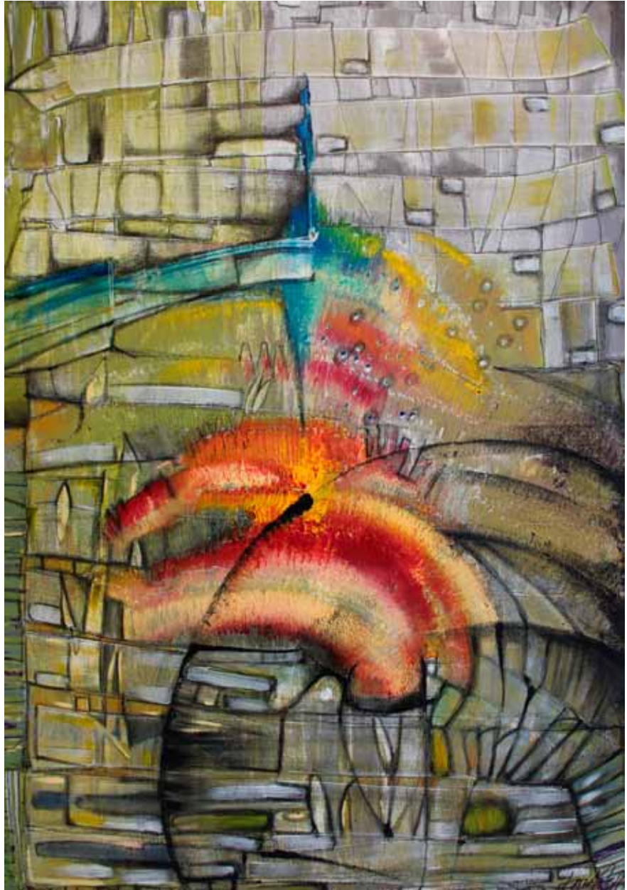
Perspective III | 2011 | 19,7 x 19,7 in