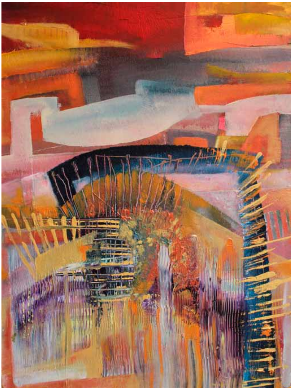
Time is always against | 2011 | 23,6 x 31,5 in