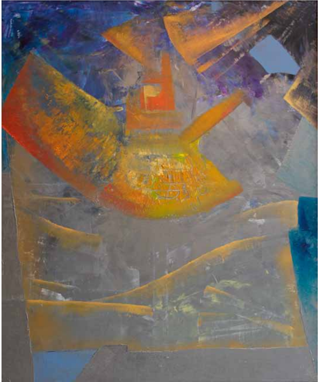
Guardian | 2011 | 47,2 x 39,37 in